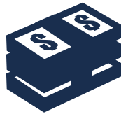
Banking & Finance